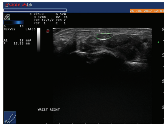
Figure 2: Ultrasound measurement of median nerve at wrist carpal tunnel (Green dash line circled)